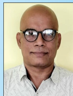
ANANDHAN South Zone

Secretariat : C-111, Ground Floor, Lajpat Nagar Part-II, New Delhi-110024