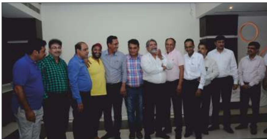
ADITI Head Office Bearers and Expodent North Zone Office Bearers during the Dinner on 12th of September 2015.